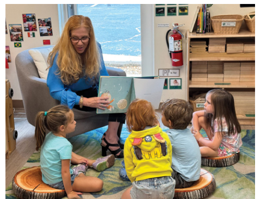
Childcare Resources of Indian River