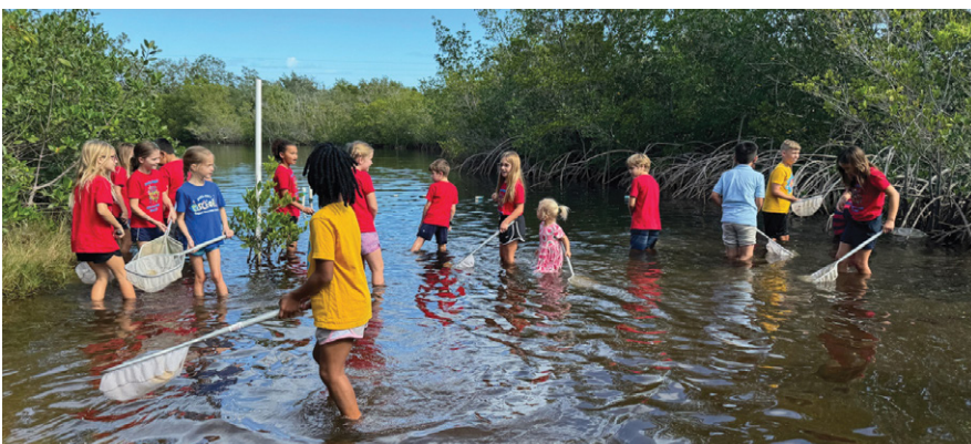
Environmental Learning Center